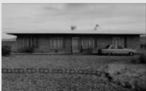
BLOCK HOUSE Rice, AZ (1991)