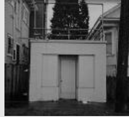
WHITE OUT Oakland, CA (2000)

Black and white Matted and framed 16"x20"