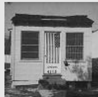
GORDONS Van Nuys, CA (1996)

Black and white Matted and framed 16"x20"