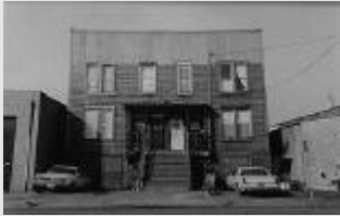
JACK LONDON ROW HOUSE Oakland, CA (1999)

Black and white Matted and framed 16"x20"