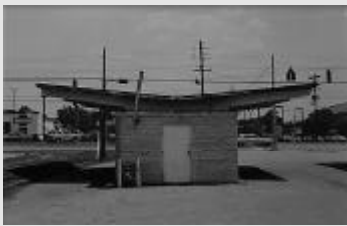
KILLING TIME ON THE WAY TO THE CEMETERY Louisville, KY (2000)

Black and white Matted and framed 16"x20"