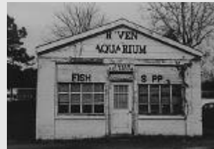
RAVEN AQUARIUM SUPPLIES Richmond, VA (2000)

Black and white Matted and framed 16"x20"