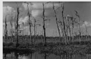
SWAMP Houma, LA (1989)

Black and white Matted and framed 16"x20"