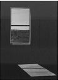
REVERSE SHADOW Marfa, TX (2001)

Black and white Matted and framed 16"x20"