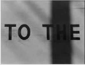
WHOLESALE TO THE PUBLIC San Francisco, CA (1998)