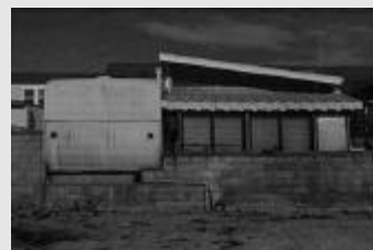
LIDO TRAILER PARK Newport Beach, CA (1999)