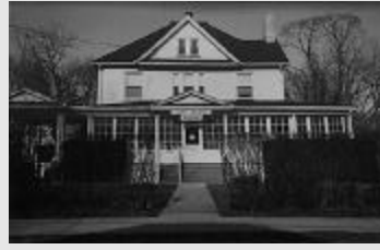
LAWN MANOR ROOMS Pleasantville, NJ (1986)

Black and white Matted and framed 18"x24"