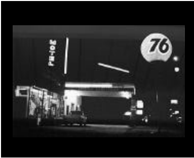
NIGHT AT THE 76 Ely, NV (1991)