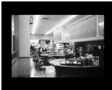
WOOLWORTH'S 23RD STREET New York, NY (1989)

Black and white Matted and framed 16"x20"