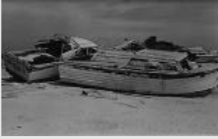
MARGATE CAUSEWAY BOAT YARD Margate, NJ (1986)