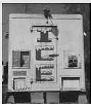
ICE Van Nuys, CA (1996)

Black and white Matted and framed 16"x20"