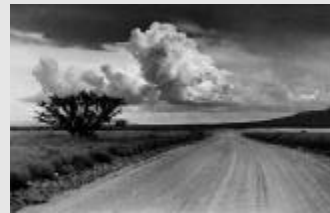
CHASING CLOUDS Elgin, AZ (2001)

Black and white Matted and framed 16"x20"