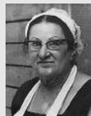
LA SIGNORA DI CORSO GARIBALDI Milan, Italy (1989)