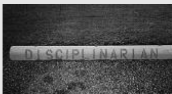
SCHOOL PARKING LOT New Orleans, LA (1989)