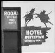
BATH IN EVERY ROOM Oakland, CA (1999)