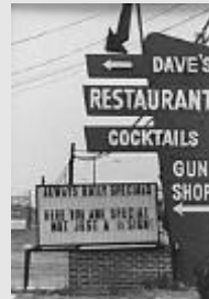
COCKTAILS AND GUNS Roanoke, VA (1989)

Black and white Matted and framed 16"x20"