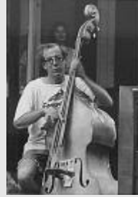
BOURBON STREET New Orleans, LA (1989)

Black and white Matted and framed 16"x20"