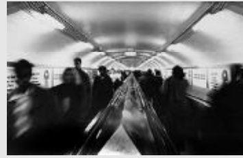
MÉTRO Paris, France (1989)

Black and white Matted and framed 16"x20"