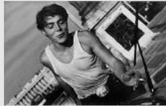
PLACE DE LA CONCORDE Paris, France (1989)

Black and white Matted and framed 16"x20"