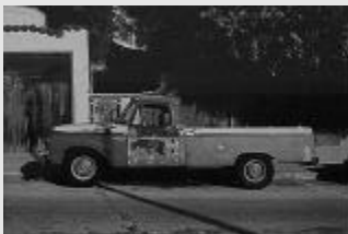
SILVERLAKE PICK UP Los Angeles, CA (1998)