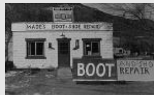
WADE'S Ely, NV (1991)

Black and white Matted and framed 16"x20"