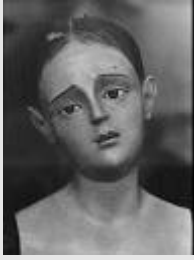
MERCATO DELL'ANTIQUARIATO Bollate, Italy (1989)