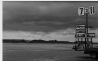
7-2-11 Kayenta, AZ (1991)

Black and white Matted and framed 16"x20"