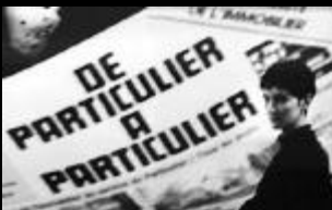
DE PARTICULIER A PARTICULIER Paris, France (1989)

Black and white Matted and framed 16"x20"