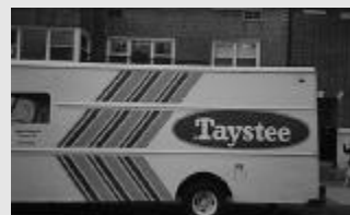
TAYSTEE New York, NY (1994)

Black and white Matted and framed 16"x20"