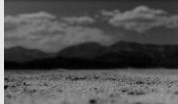
MONO LAKE Lee Vining, CA (1991)

Black and white Matted and framed 16"x20"