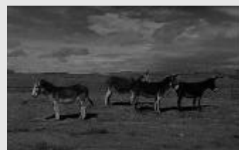
HIGHWAY 163 Highway 163, AZ (1991)