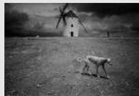
QUIXOTIC La Mancha, Spain (1992)

Black and white Matted and framed 16"x20"