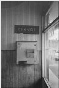
CHANGE Los Angeles, CA (1998)

Black and white Matted and framed 16"x20"