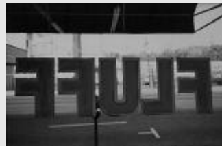
FLUFF Los Angeles, CA (1994)

Black and white Matted and framed 16"x20"