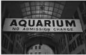
STEEL PIER AQUARIUM Atlantic City, NJ (1986)