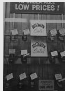
UNBEATABLE LOW PRICES New York, NY (1989)

Black and white Matted and framed 16"x20"